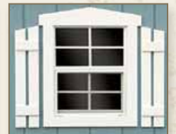
Fancy Window Trim and Shutters