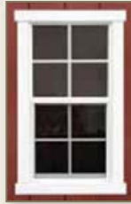
18" x 36" Slider Window shown with 1" x 3" wood window trim