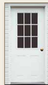
9-Lite Glass Prehung Door