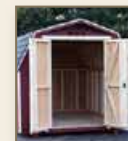
Doors are reinforced with 2" x 4" bracing.