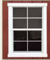
24" x 36" Slider Window shown with 1" x 3" wood window trim