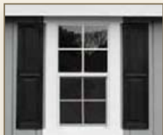
Raised Panel Shutters