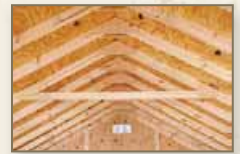
Collar ties are used on all buildings over 18' long.