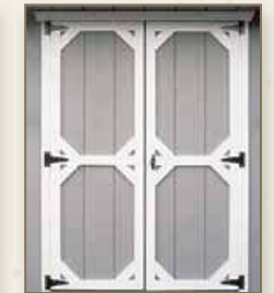
Dutch Door Trim