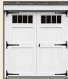
Deluxe Doors with Transoms