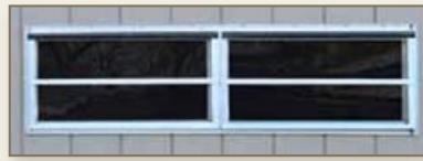
15" x 60" Jalousie Window