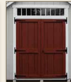
Deluxe Doors with Transom above Doors