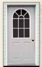
11-Lite Arched Glass Prehung Door