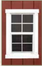
18" x 27" Slider Window shown with 1" x 3" wood window trim