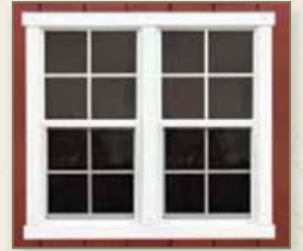
18" x 36" Double Window shown with 1" x 4" wood window trim