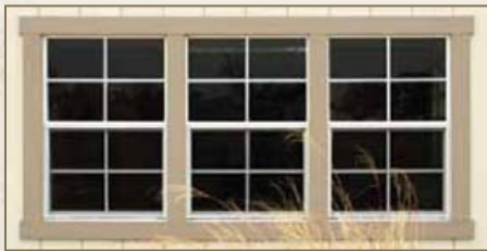
24" x 36" Triple Window shown with 1" x 4" wood window trim