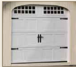
Homestead Overhead Door with Stockton Glass