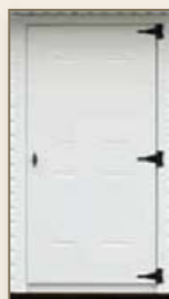
Standard Steel Door