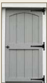
Single Door with Arch Trim