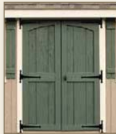
Deluxe Doors with Arch Trim