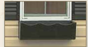
Vinyl Flower Box