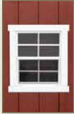
18" x 23" Slider Window shown with 1" x 3" wood window trim