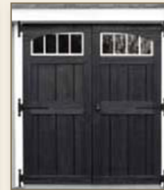
Deluxe Doors with Arch Trim & Transoms