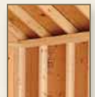
Double 2" x 4" top plate on all side walls over 18' long and A-Frames over 16' long.