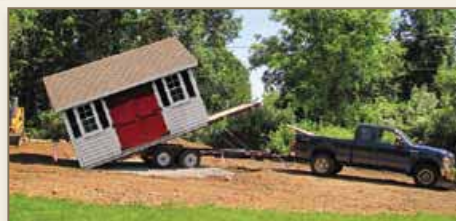
All buildings are fully assembled and delivered to your prepared site. Kits are available if your location is not accessible by truck and trailer.