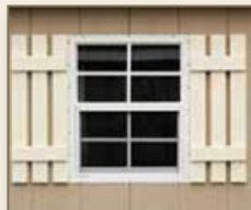
3" Slat Shutters