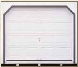
Standard Overhead Door