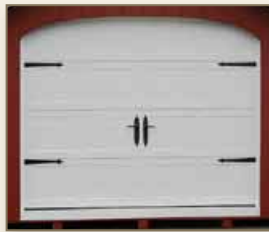
Homestead Overhead Door