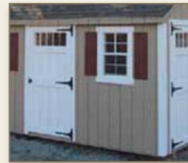
Deluxe Trim Package: 1" x 4" trim on doors, corners, and window trim