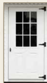
9-Lite Glass Steel Door