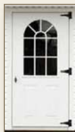
11-Lite Arched Glass Steel Door