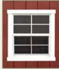
24" x 27" Slider Window shown with 1" x 3" wood window trim