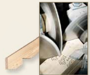
Accurate machine cut rafters make a tight joint for maximum strength and precise construction.